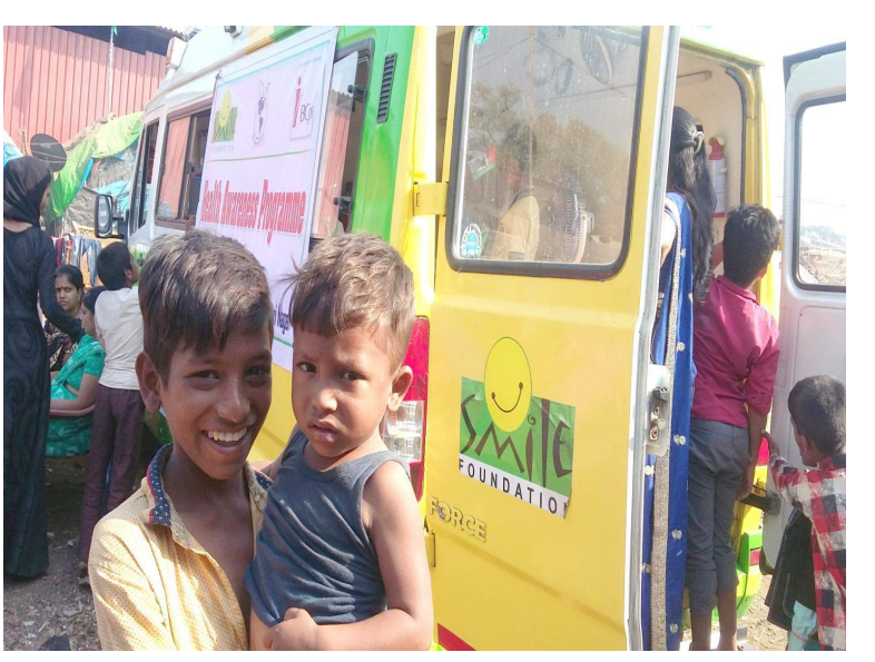
Public Awareness on various programs